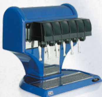
Torre Post Mix 6 Válvulas